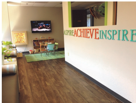
Lobby area in the Achievable Clinic

Chamber of Commerce, The Culver City News, Ignite Arts Center, Dale's Liquor Jr and everyone else who contributed to a successful clinic opening!