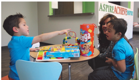
A family in the Achievable Clinic play area

Schedule your appointment at (424) 266-7474 or clinic@achievable.org