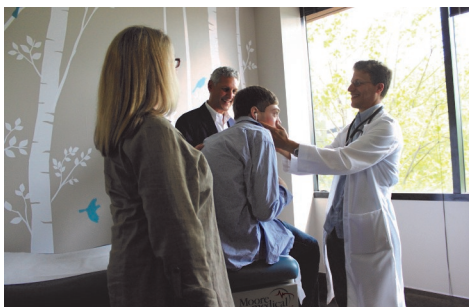
Our patient centered approach in action at the Achievable Clinic

Children and adults with developmental disabilities have more health problems and more difficulty getting appropriate healthcare than the general population. In Los Angeles, thousands of people with developmental disabilities suffer with untreated health issues because they lack access to medical providers trained to treat them.