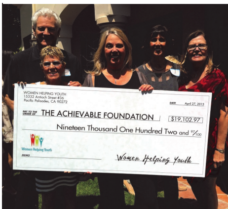
WHY presenting their generous contribution

info@womenhelpingyouth.org or visit their website, www.womenhelpingyouth.org . We thank WHY for their generous support of the Achievable Clinic!